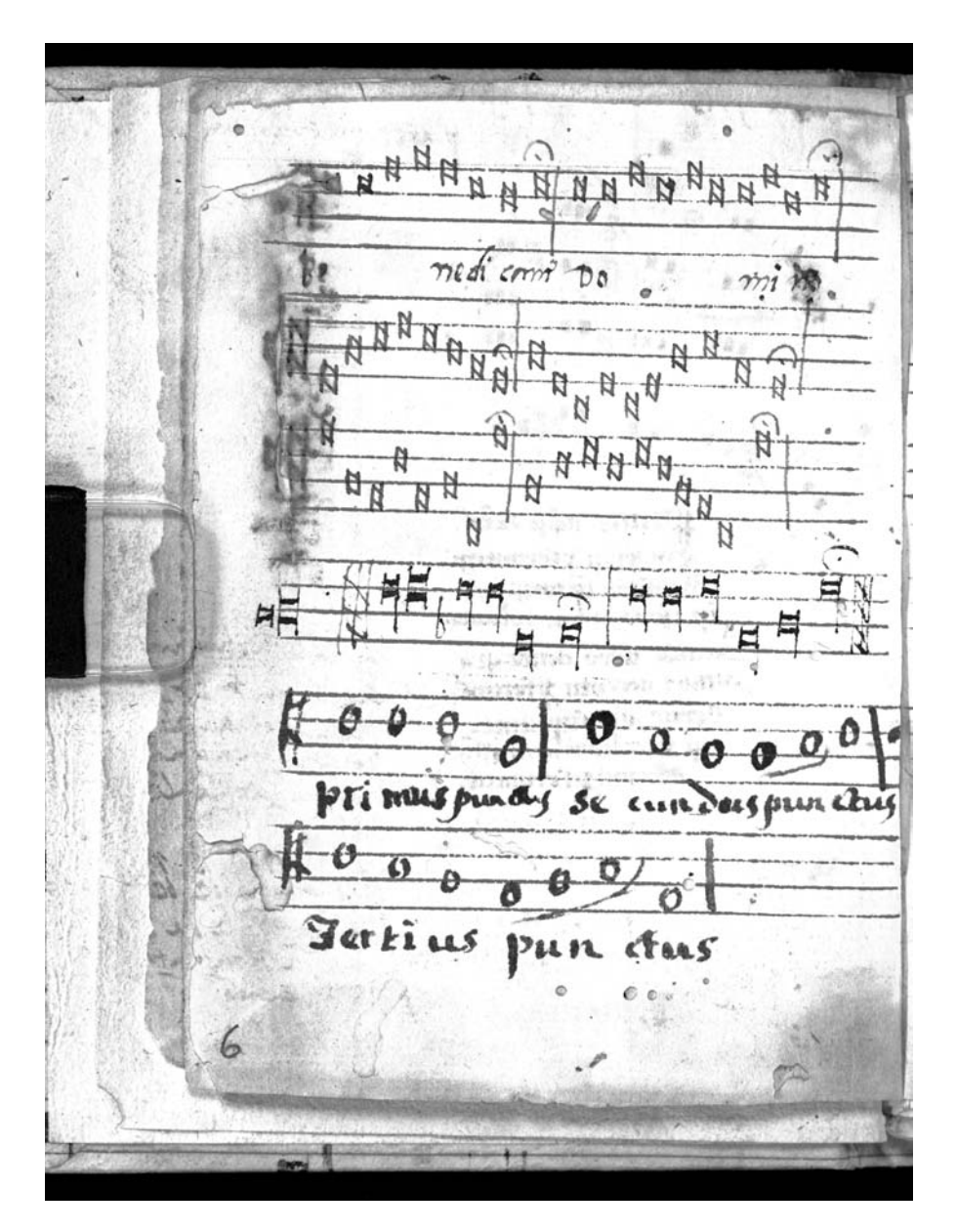
LHD 244 (University of Melbourne), p. 6